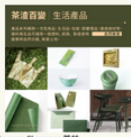
Chazene 茶莊: turning recycled tea leaves into new materials for buildings or daily products