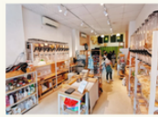
Source: Macao News Mailon Store (米厘雜貨店): Locally produced foods & natural products