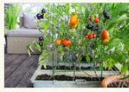
Mighty Greens Macau: provides local microgreens through urban farming and education to local community