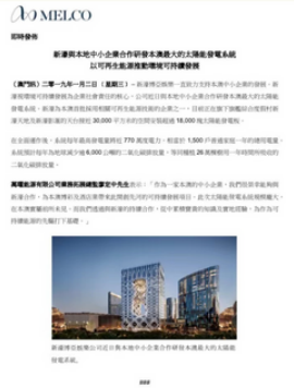
Melco Resorts & Entertainment Limited cooperates with local SMEs to develop the largest solar power system in Macau.