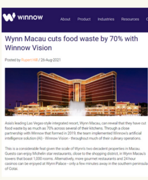
Hotels under different gaming operators - Sands China, Wynn Macau, and Melco - are adopting AI solution to food waste problem.